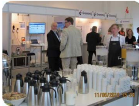
Coffee and lunch breaks at the exhibition.