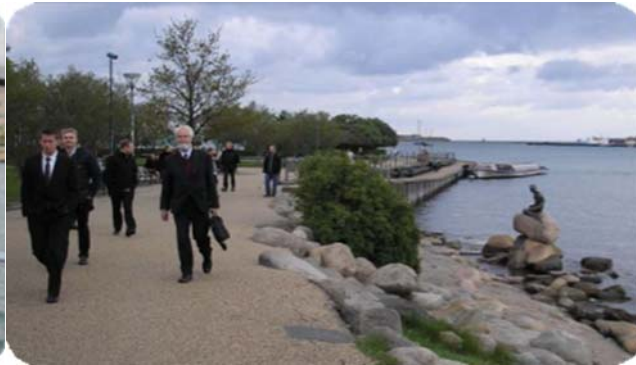
Walking past the Little Mermaid near Langelinie Pavilion.