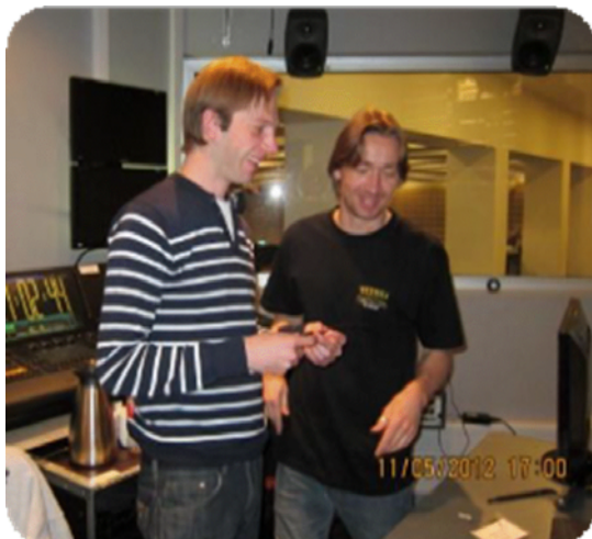
The two technicians at TCC