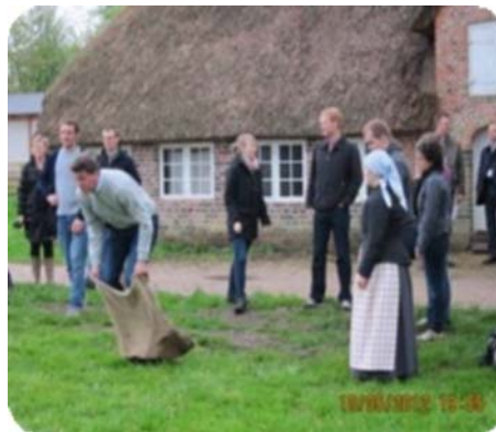
Moving quickly but carefully!