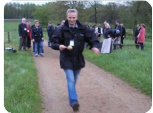
Everything under control at Frilandsmuseet (The Open Air Museum)