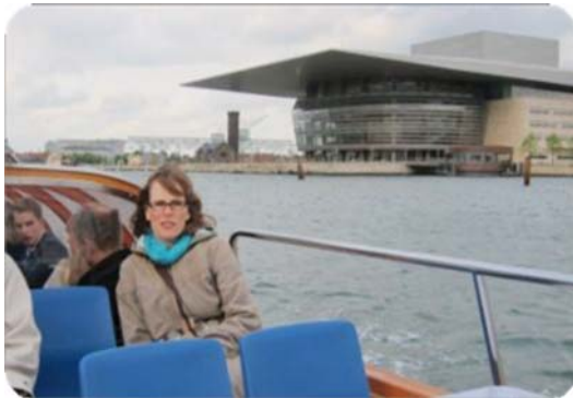
Sailing past the Opera House.