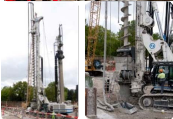
Technical visit at the Metro City Circle Line (Cityringen)