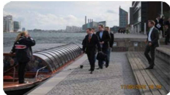
Leaving for the banquet in Copenhagen's canal boats