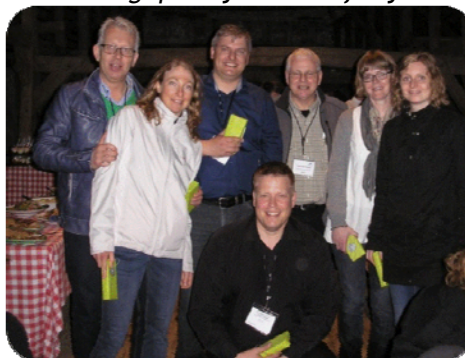
The winning team no. 5.