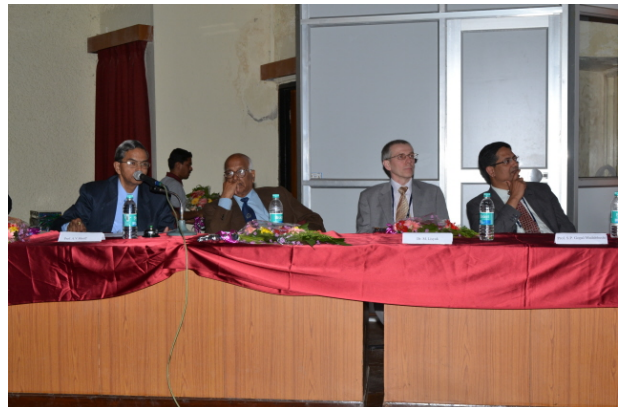
Photo 4: Invited Speakers with session Chair and Co-Chair during a Plenary session of IGC-2010