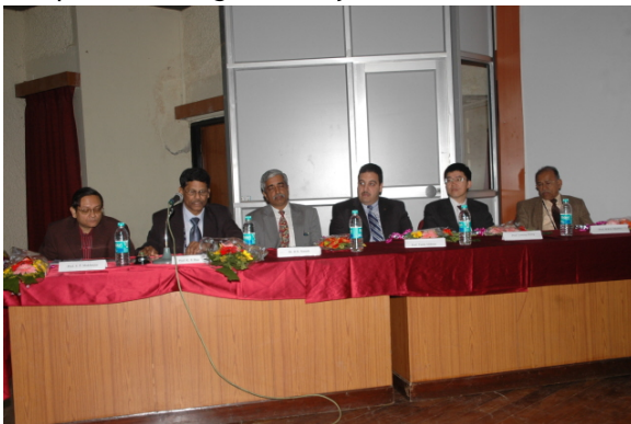
Photo 5: Invited Speakers with session Chair and Co-Chair during a Plenary session of IGC-2010