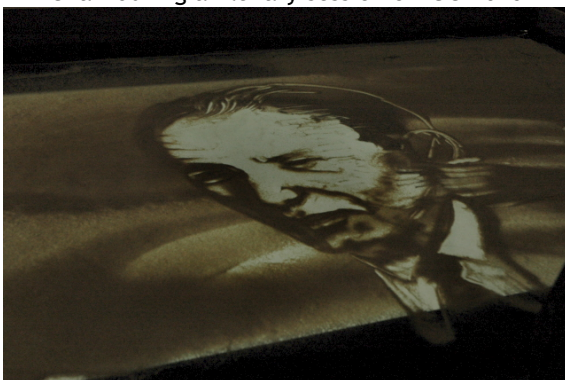
Photo 7: Sand Animation of Karl Terzaghi, made during Cultural Program of IGC-2010