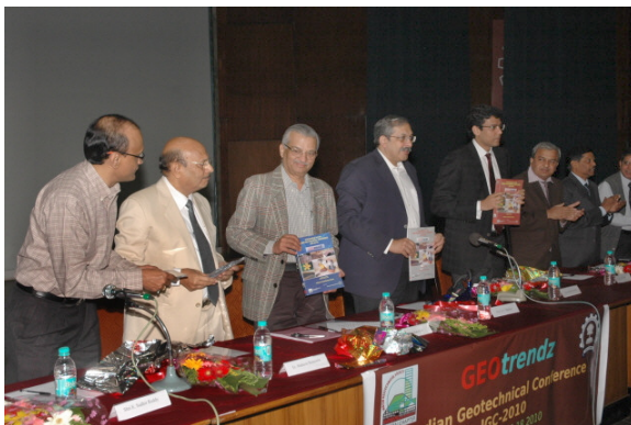
Photo 1: Release of Conference Proceedings during Inaugural Program of IGC-2010