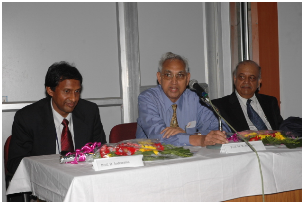
Photo 3: Session Chair introduces the Keynote Speaker during a Plenary Session of IGC-2010