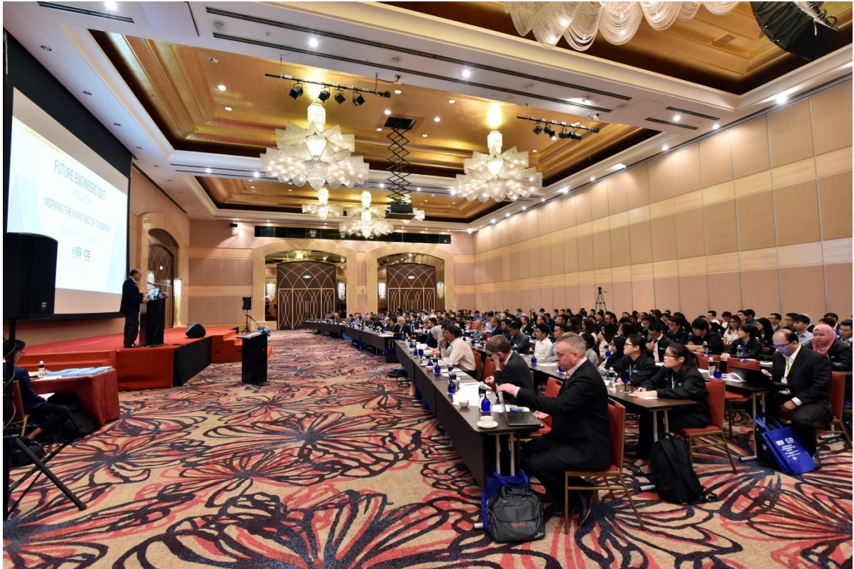
View of the Conference Participants