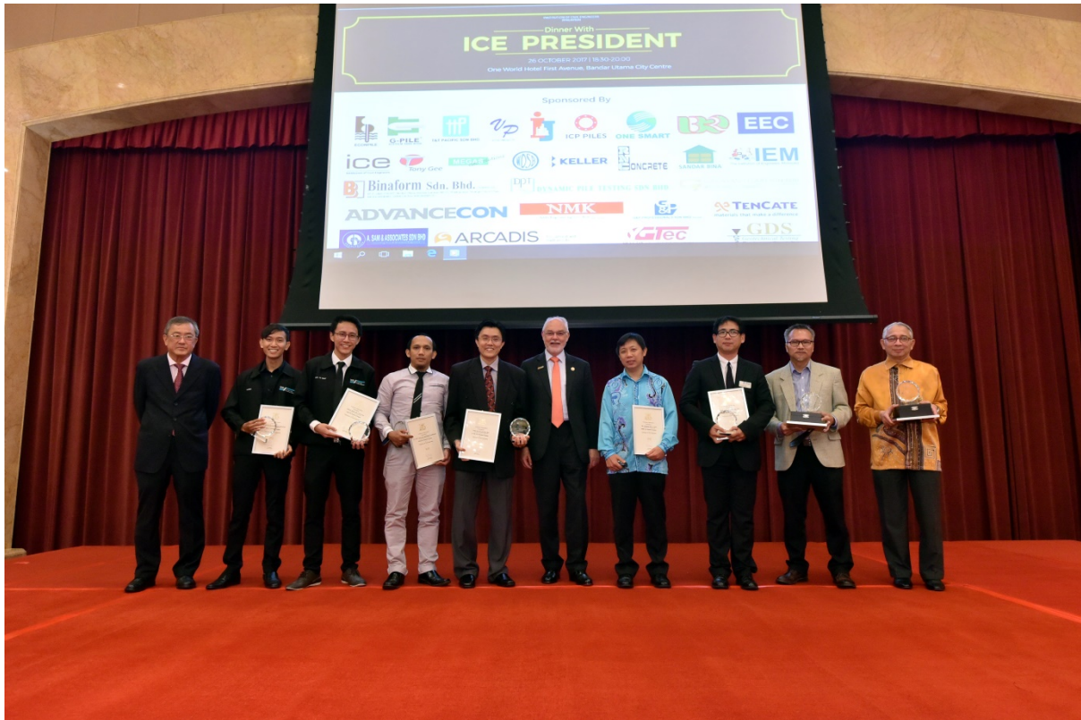
Group Photo of Recipients of Certificate of Appreciation from ICE President