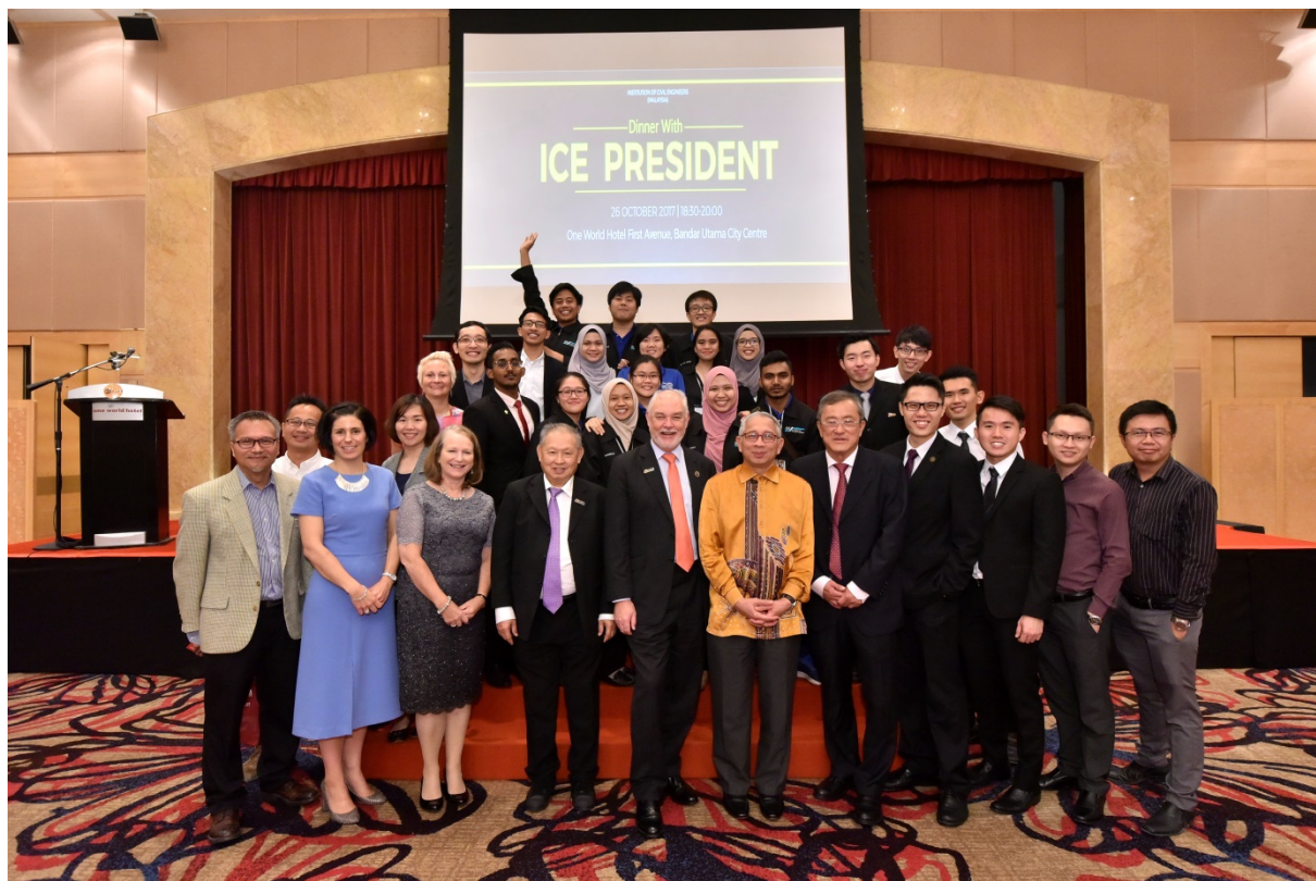
Universiti Tenaga Nasional (UNITEN) ICE STUDENT CHAPTER