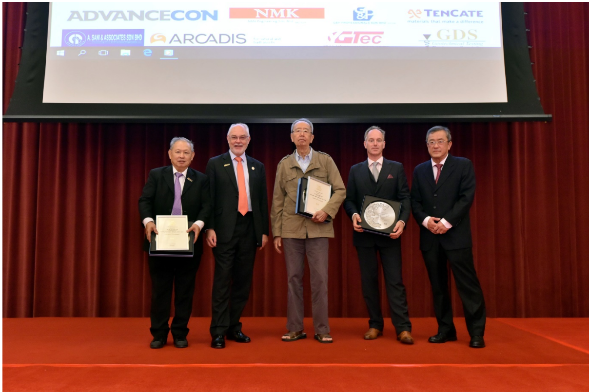
Group Photo of Recipients of Long Service to ICE Award