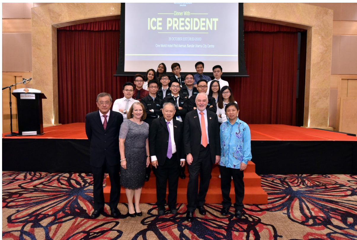
University Nottingham Malaysia Campus (UNMC) ICE STUDENT CHAPTER