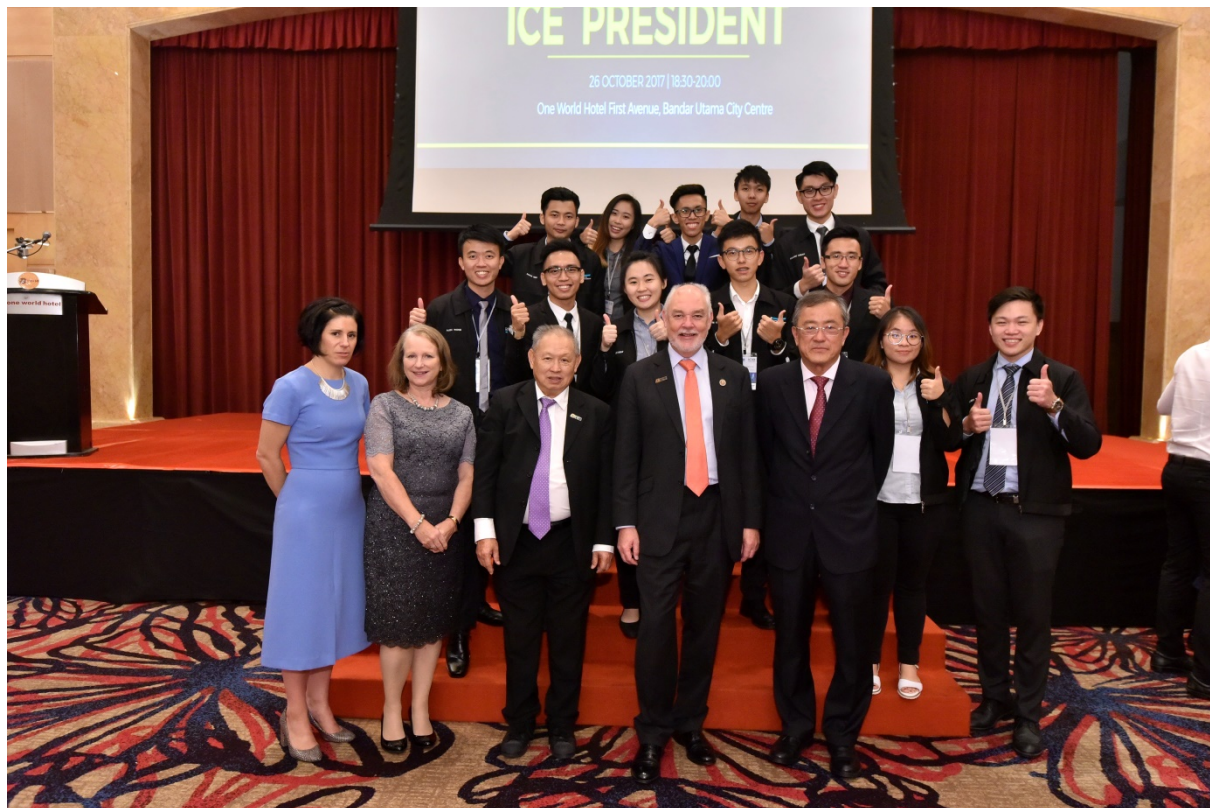
University Tunku Abdul Rahman (UTAR) ICE STUDENT CHAPTER