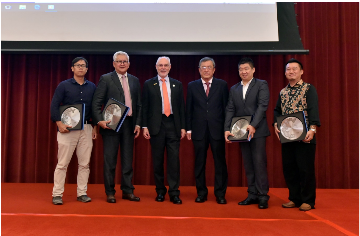
Group Photo of Key Sponsors with ICE President and ICE Country Representative for Malaysia