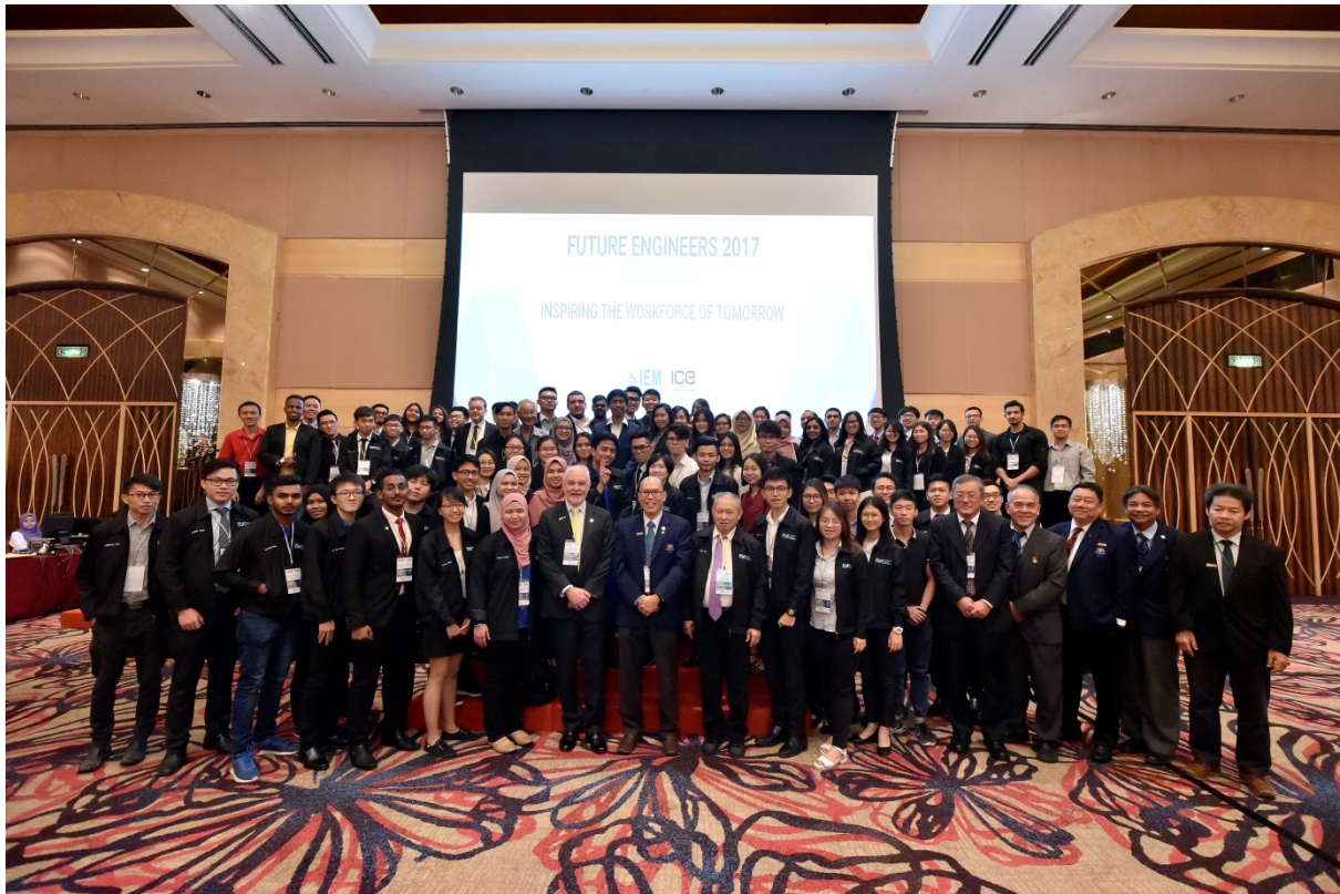
Group Photo with the President of ICE and President of IEM