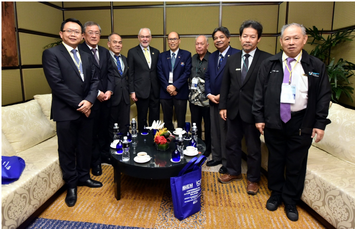
At the VIP Room President ICE and IEM President with VIP Guests