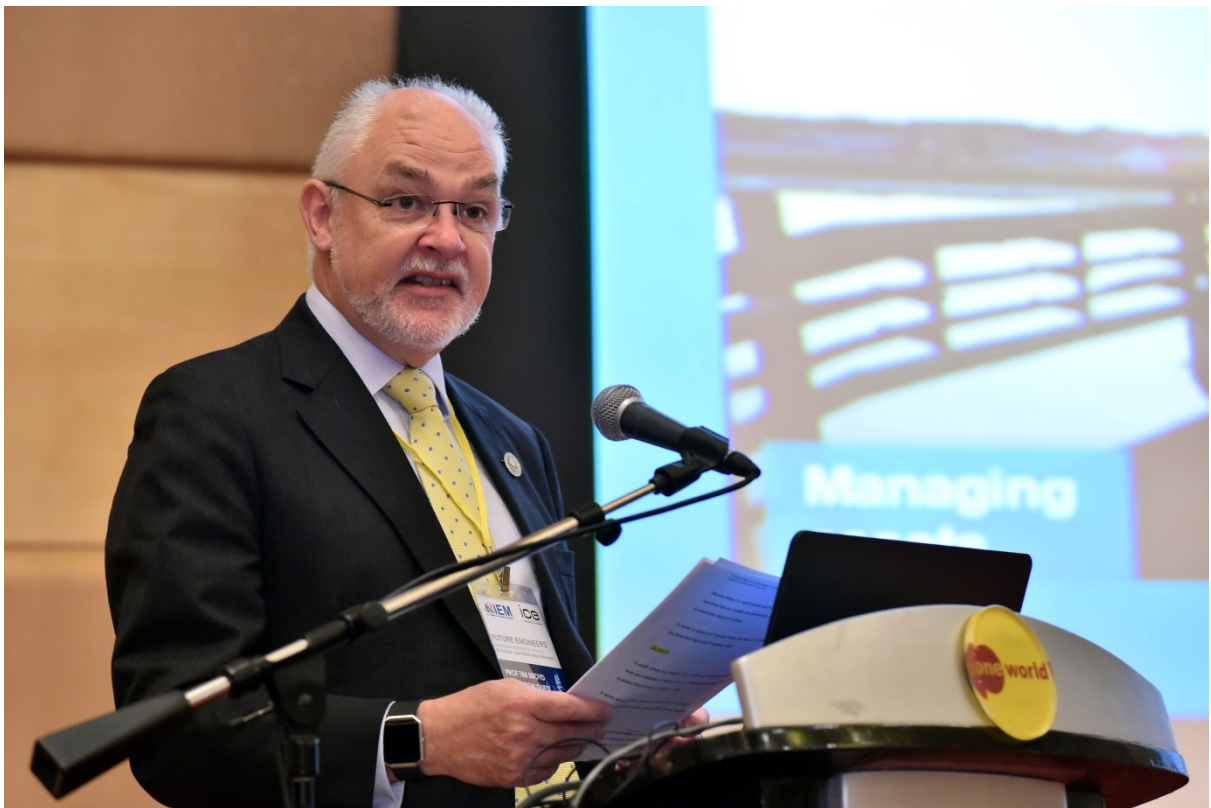
President ICE Delivering his Keynote Lecture - ICE-Led Project 13