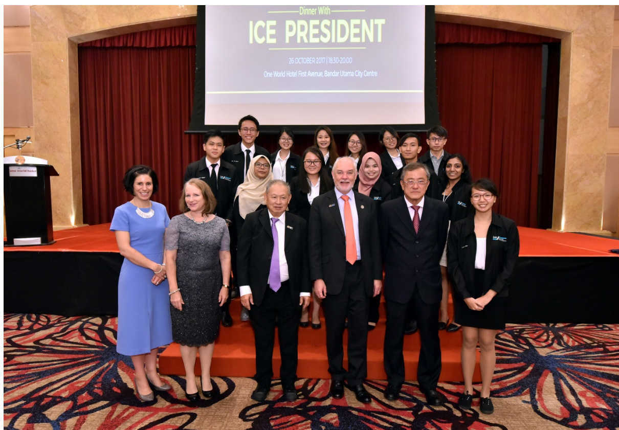
University Malaya (UM) ICE STUDENT CHAPTER