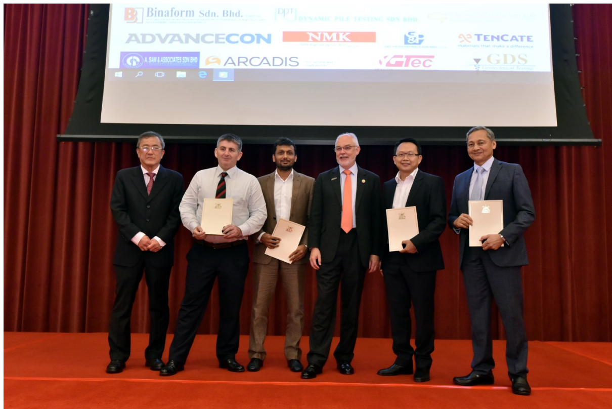
Group Photo of Recipients of FICE with ICE President and Country Representative for Malaysia