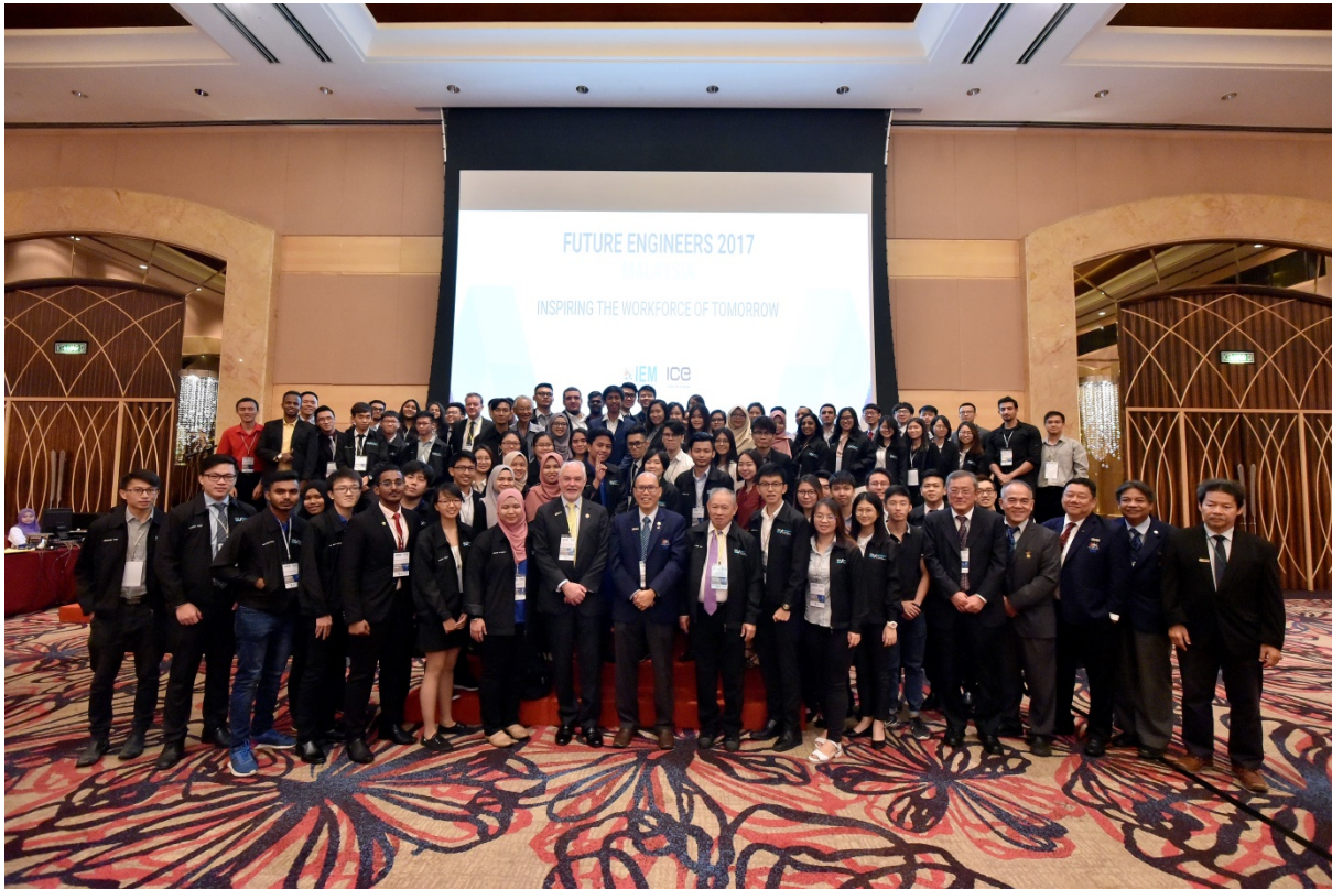
Group Photo with the President of ICE and President of IEM