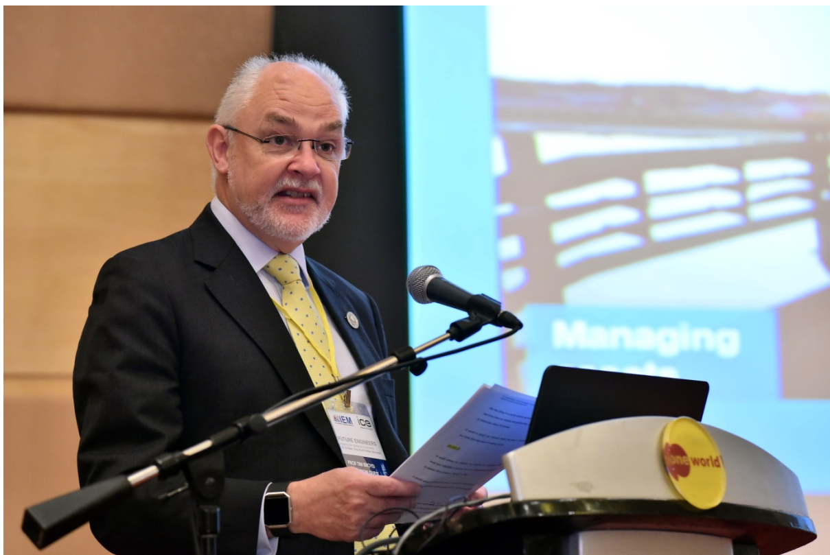
President ICE Delivering his Keynote Lecture - ICE-Led Project 13