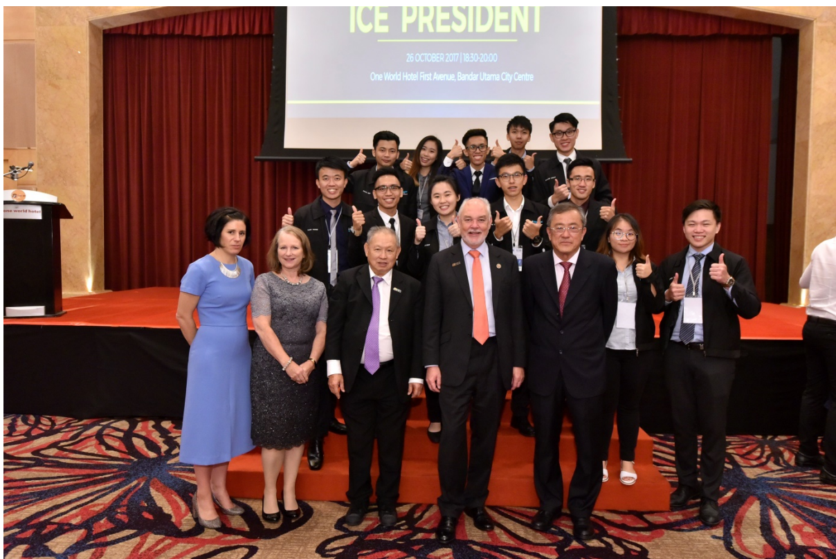
University Tunku Abdul Rahman (UTAR) ICE STUDENT CHAPTER