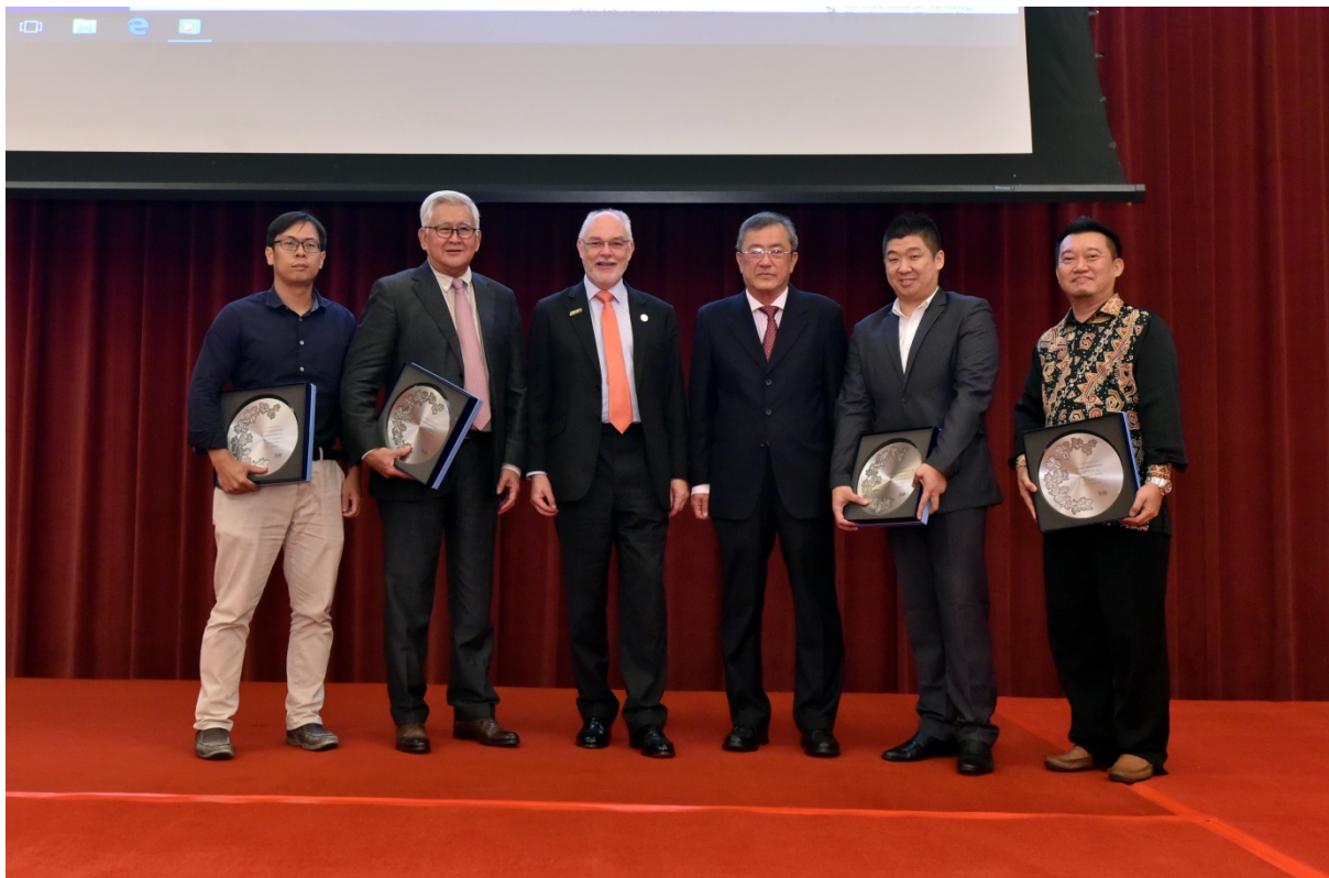
Group Photo of Key Sponsors with ICE President and ICE Country Representative for Malaysia