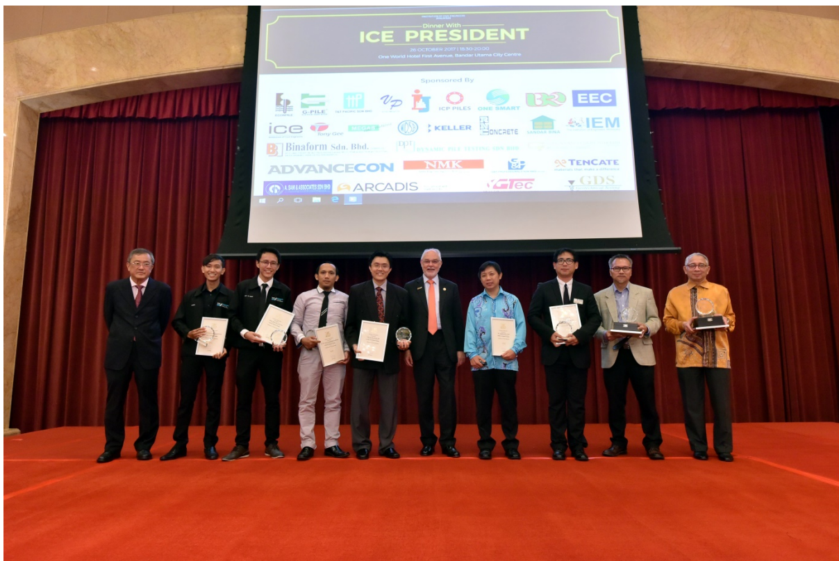
Group Photo of Recipients of Certificate of Appreciation from ICE President