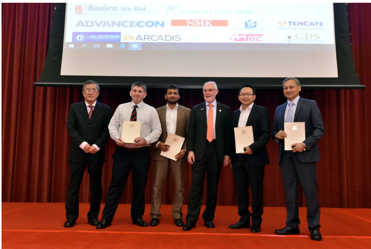
Group Photo of Recipients of FICE with ICE President and Country Representative for Malaysia