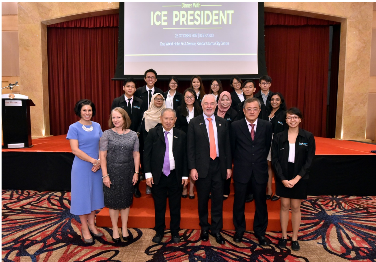
University Malaya (UM) ICE STUDENT CHAPTER