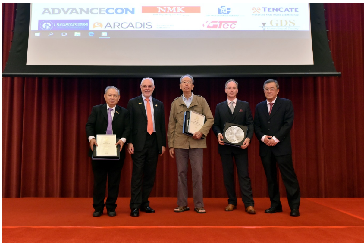
Group Photo of Recipients of Long Service to ICE Award