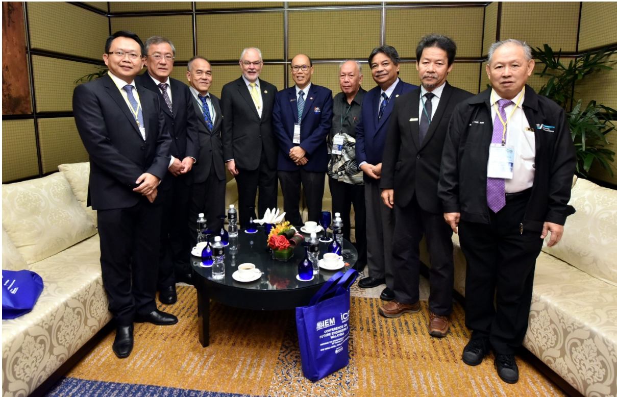
At the VIP Room President ICE and IEM President with VIP Guests