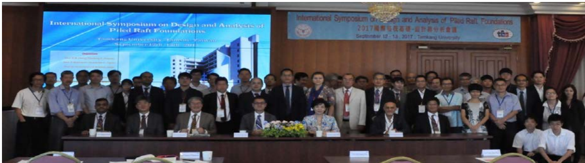
Group photo of the 2017 Int. Symposium on Design and Analysis of Piled Raft Foundations