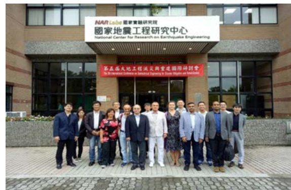
Delegates to visit NCREE