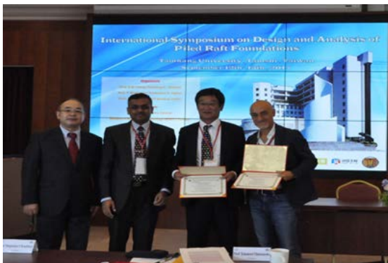
Photo of the speakers