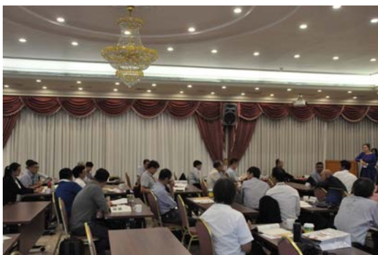
View at the discussion session