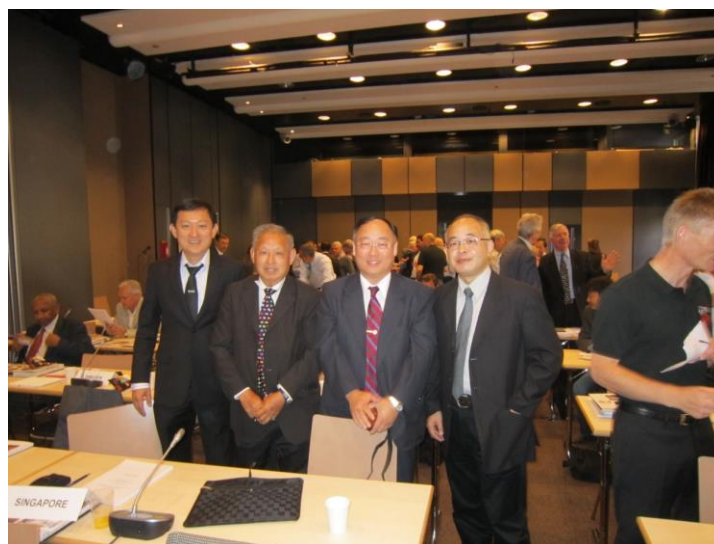
At the ISSMGE Council Meeting on 1 September 2013