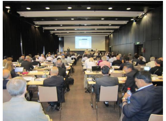
ISSMGE Council Meeting in Session