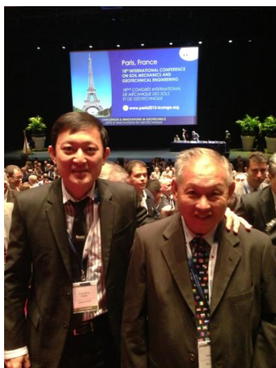
At ICSMGE Conference 2-6 September 2014