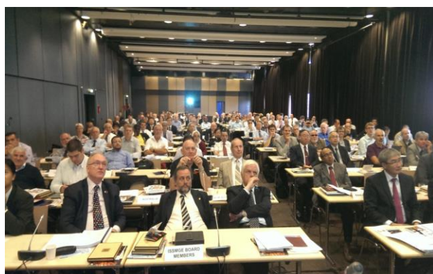
ISSMGE Council Meeting in Progress