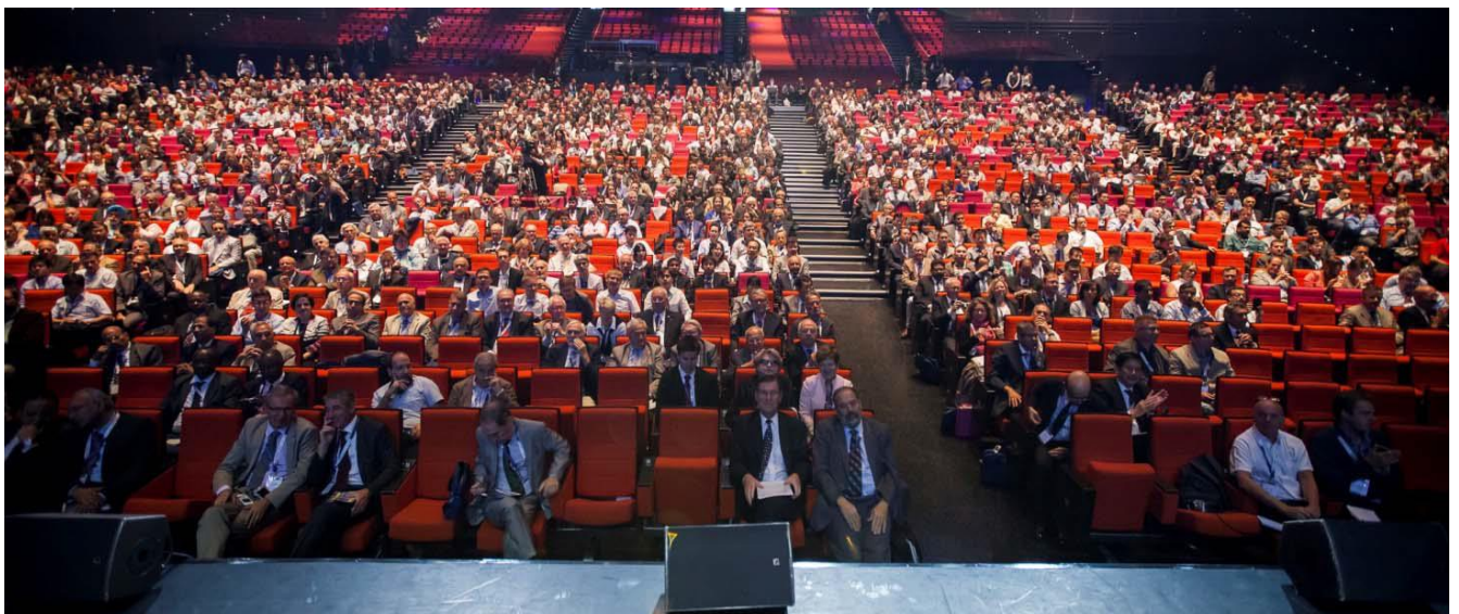
18ICSMGE Opening Ceremony