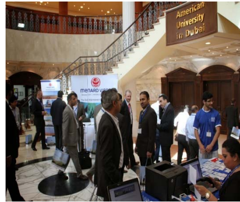
During Registration for DFIMEC 2014, Dubai