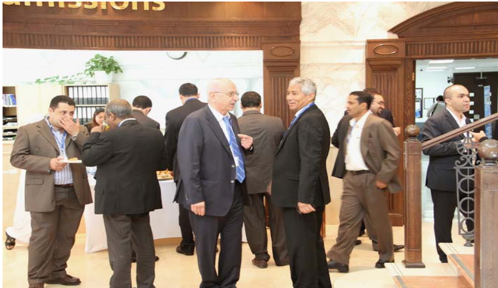
Discussions among participants during tea-break.