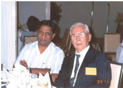
A very old PhD and consultant: Must have done his PHD when I am a kid