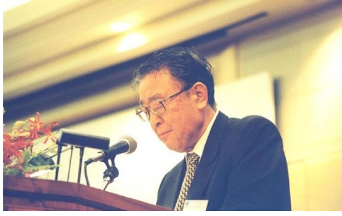
President: Japanese Technological Society