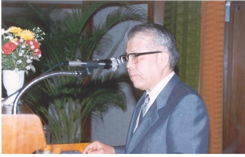
Coastal Engineering Professor at AIT before