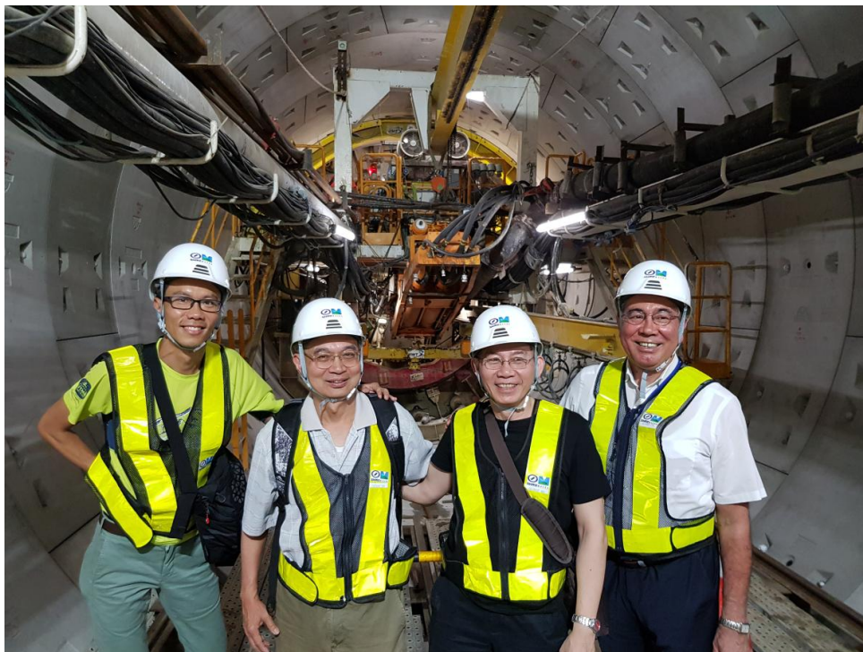
Site visit TBM metro project in HCMC