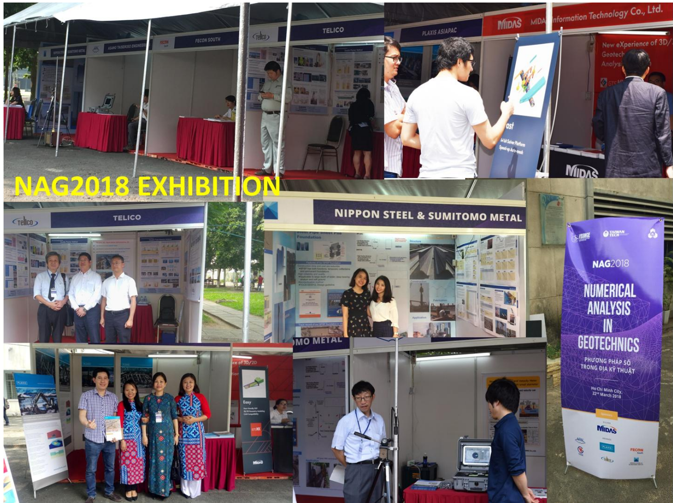
Technical exhibition at NAG2018