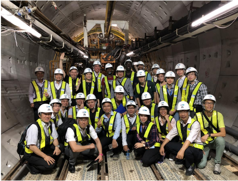
Site visit TBM metro project in HCMC