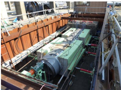
Pipe Jacking (after Le et. al, 2013)