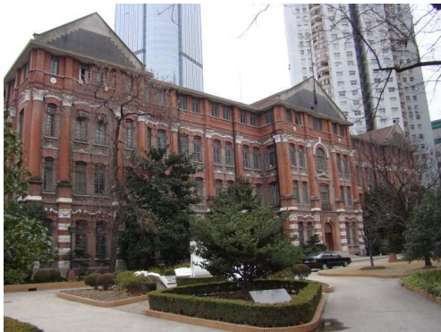
Tunnelling under Shanghai "Chongsi" (after Ge et. al, 2013)