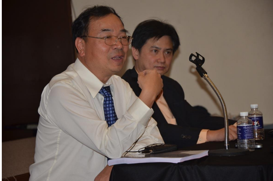
Photo 2 - Photo Taken During Question And Discussion Session