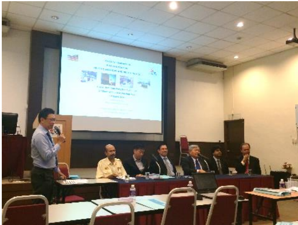
Photo 7 - Forum Session With The Panels

Local and international experts are invited to share and exchange their technical experiences at our MGS workshops and seminars. To encourage more engineers to join the society, MGS provides its member with the opportunity to attend, participate and avails to state-of-the-art lectures and papers in the local, regional, and international geotechnical conferences at discounted registration fee. MGS also provides the chance to network with other geotechnical engineers, academics, and practitioners around the world as MGS member automatically becomes member of ISSMGE.