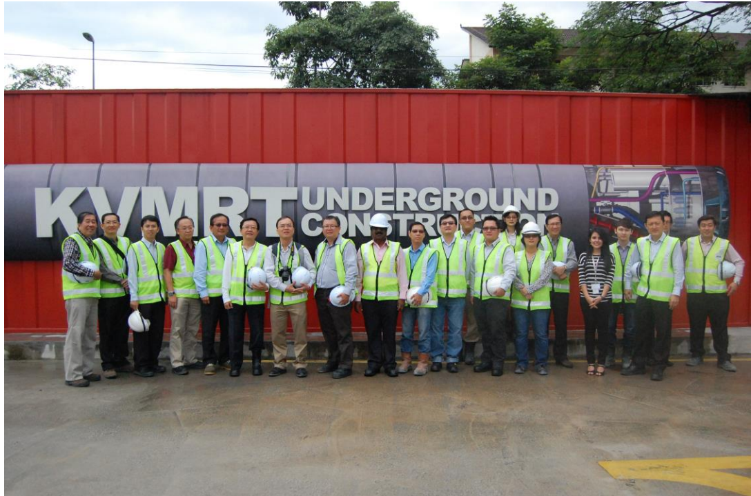
Photo 4 - Photo Taken During Visit to KVMRT Exhibition Centre