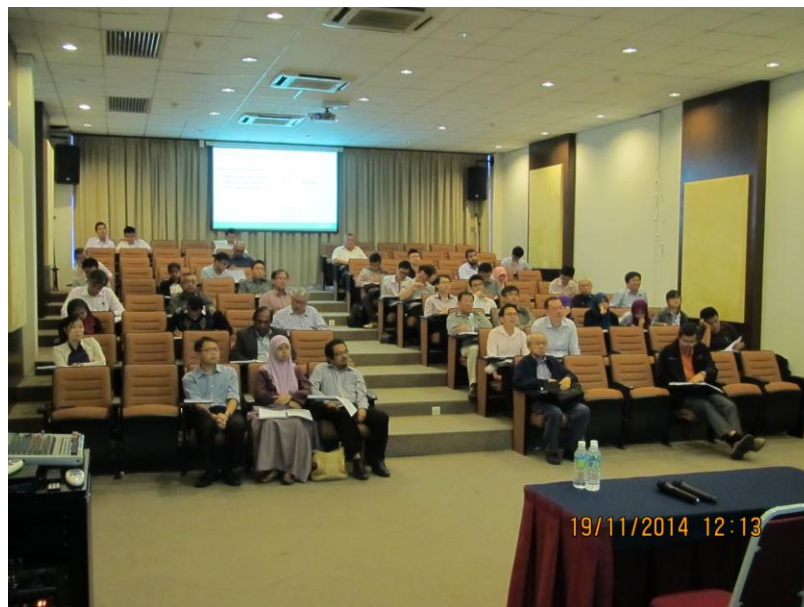
Photo 9 - Participants Attended The Workshop