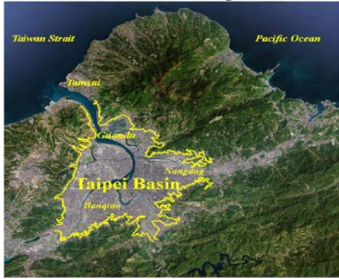
Satellite Image of the Taipei Basin (After Yang, Wong and Hwang, 2016)