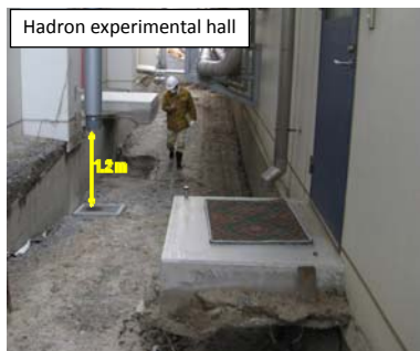
(a) Ground subsidence along building