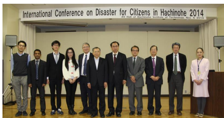
Lecturers and Chair-persons