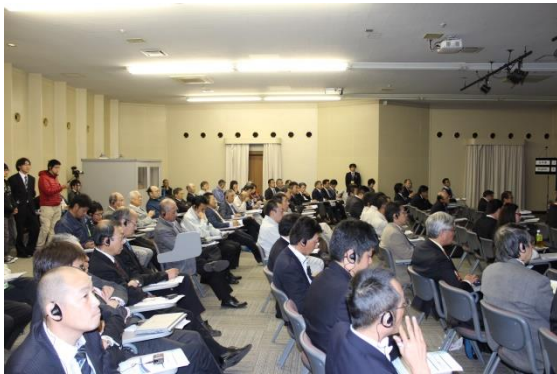
Using the simultaneous interpretation