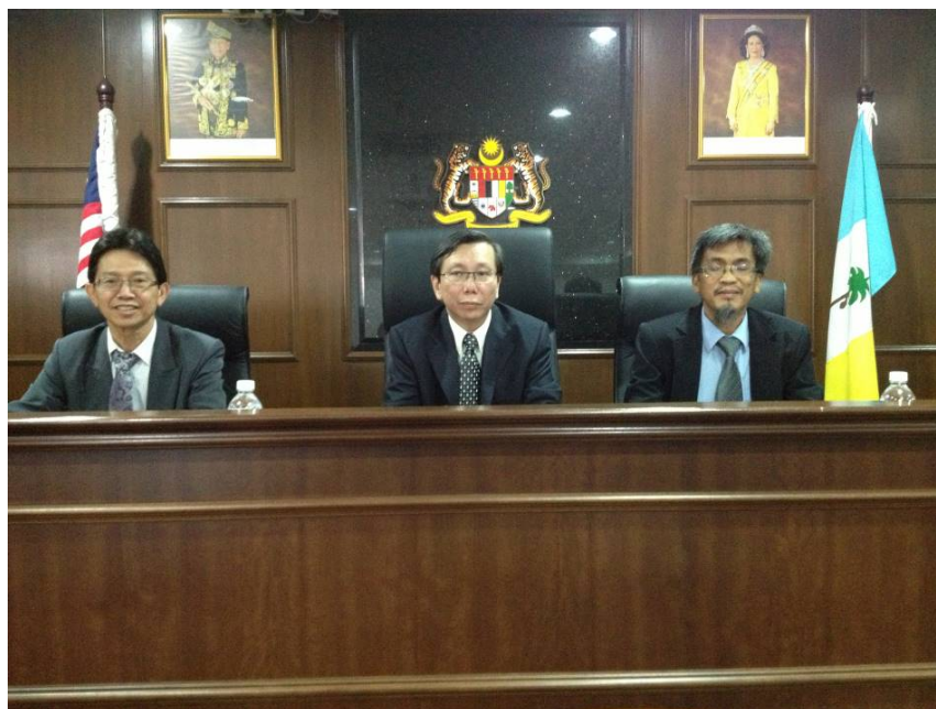
Penang Commission of Enquiry (2013) to investigate the collapse of the Fin Wall of the UMNO Building and Ramp 2 the Second Penang Bridge

In line with his expertise, he was appointed by the Governor of Penang, Malaysia as member of the Commissioner of Enquiry (2013 – 2014) to investigate the collapse of the Fin Wall of the UMNO Building and Ramp 2 the Second Penang Bridge. He was also appointed by the Minister of Transport, Malaysia as a member of the KLIA2 Independent Safety Committee (2014-2015). In 2018, he was again appointed by the Governor of Penang as member of the Commission of Enquiry (2018) to investigate the causes of landslide that claimed 11 lives at Taman Sri Bunga, Penang in 2017. He is the Chairman of Technical Advisory Panel for State of Penang since 2013. He was recently appointed as an advisor to the Kedah State Government.