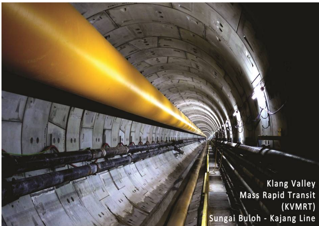
Klang Valley Mass Rapid Transit (KVMRT) Sungai Buloh - Kajang Line

G&P was the first local company to be awarded the opportunity to design and supervise both tunnels and temporary structures for MRT1, as well as the detailed design and supervision for the 13.5km of tunnel and two underground stations for MRT2