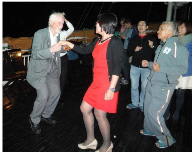
Post Conference Tour