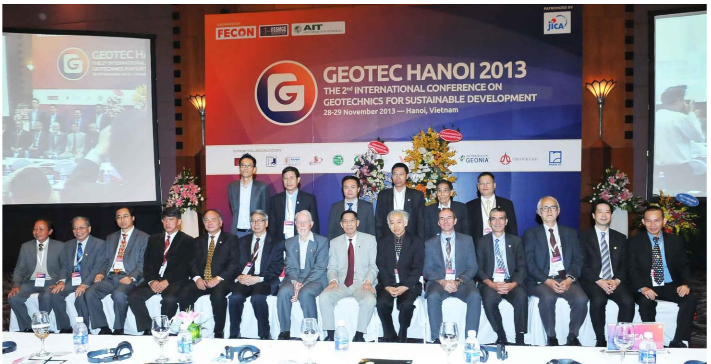
Conference's Key Persons