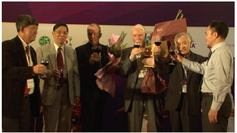
Conference Banquet "Gala Dinner"