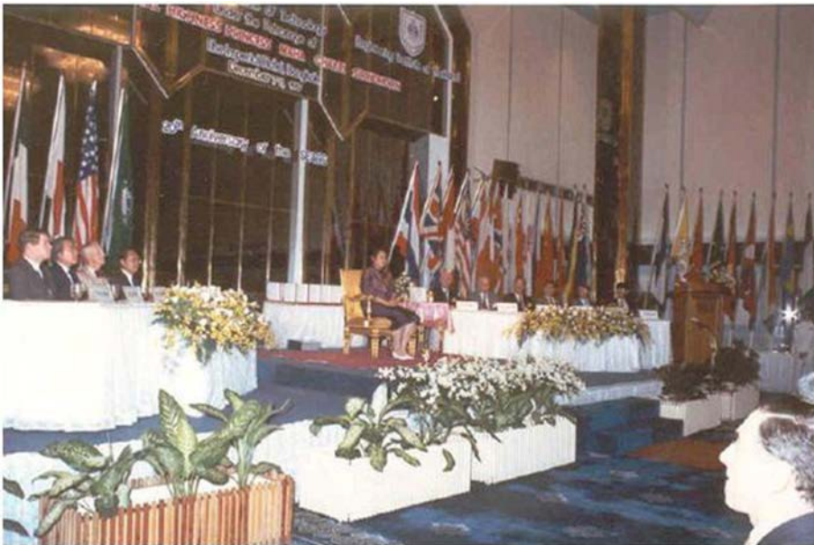
HRH Princess Sirindhorn: 9 th SEAGC Bangkok