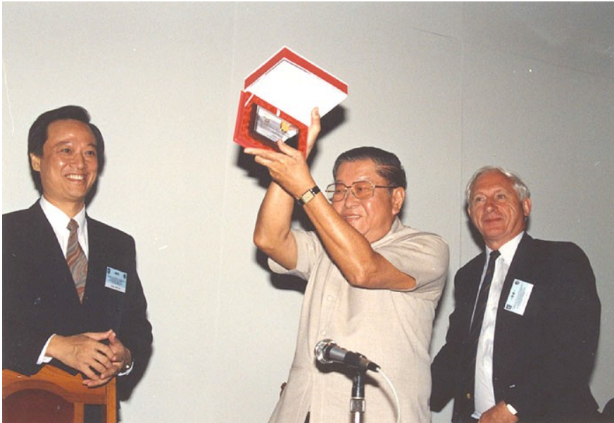
HE Thanat Khoman: 9th ARC Bangkok