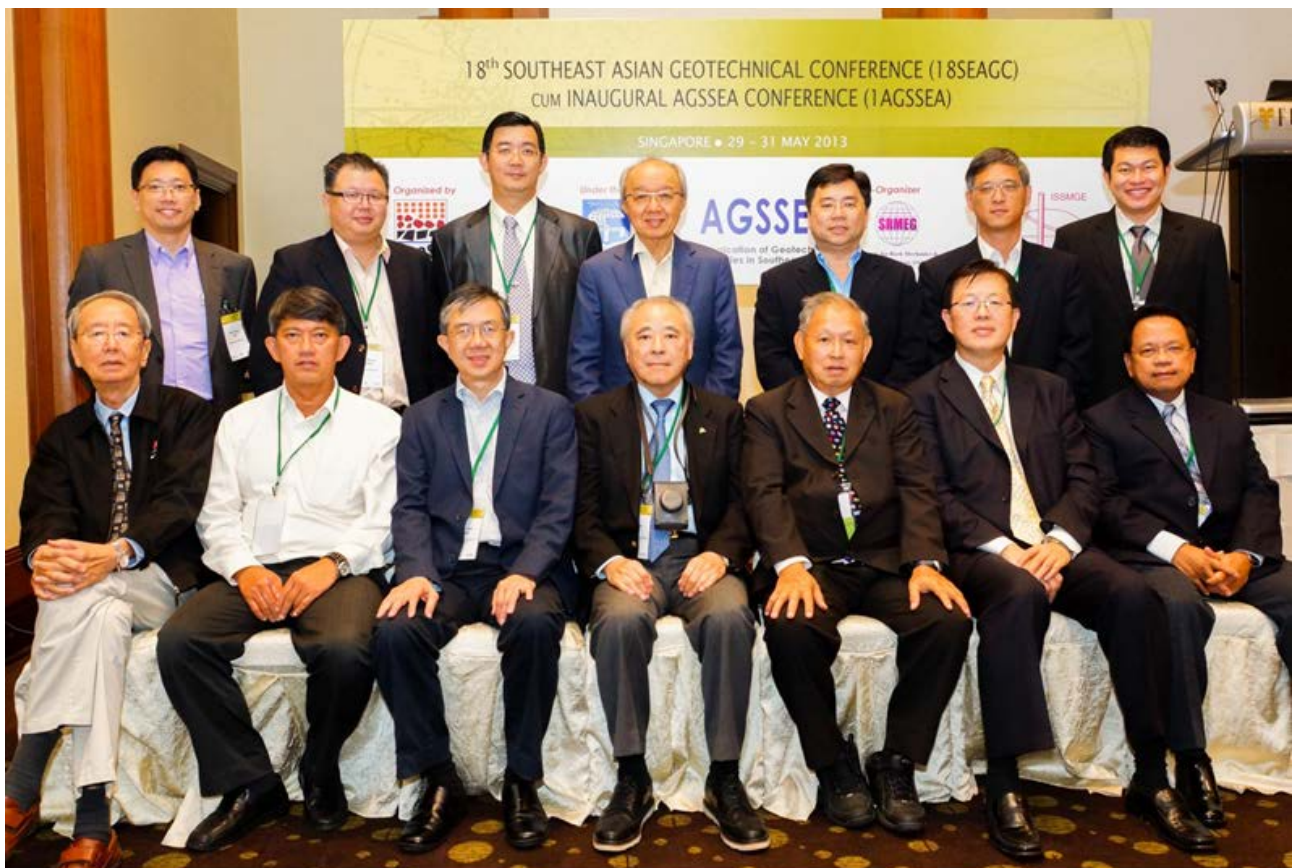
Photo: AGSSEA Inaugural Meeting Singapore

Joined SEAGS for the publication of the Journal of SEAGS-AGSSEA since 2010