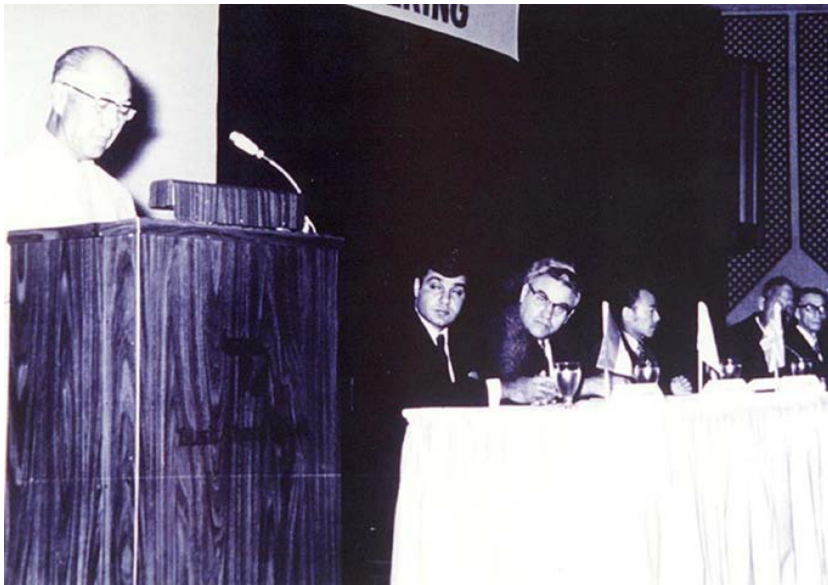
HE Pote Sarasin: 4 th ARC Bangkok