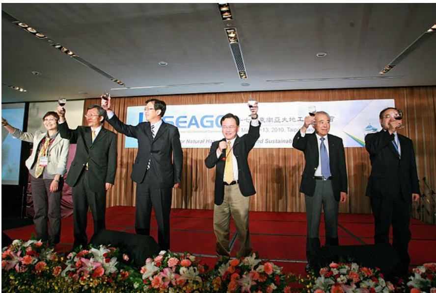
Social Function: SEAGC Taipei 2010