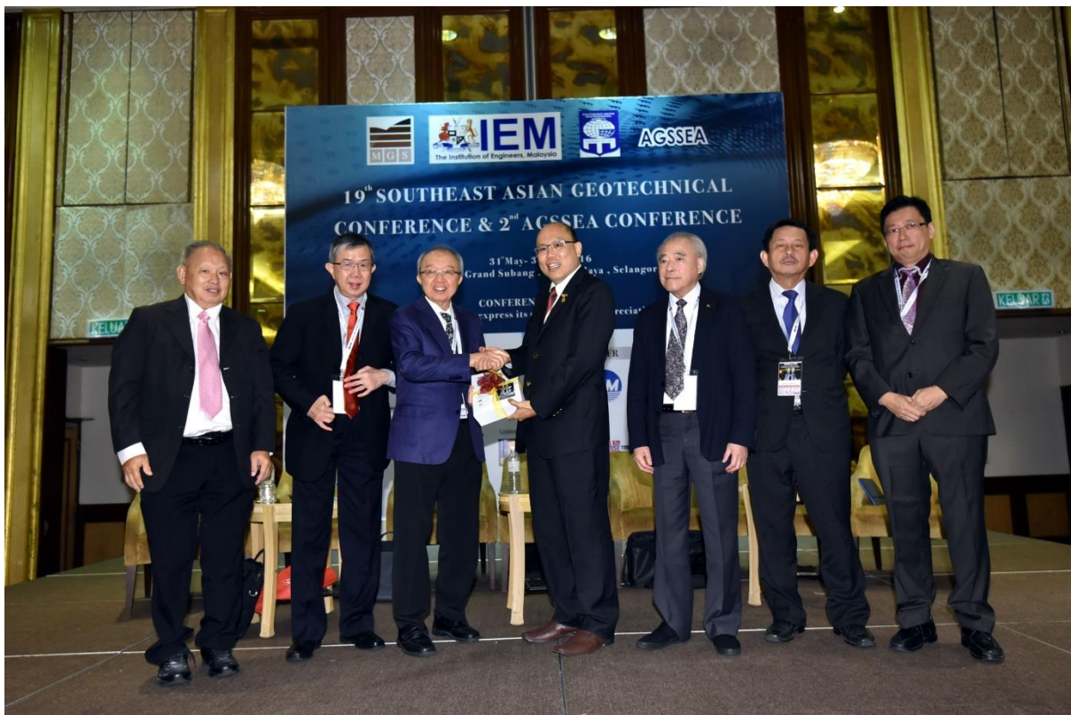
Group Photo at end of the Opening Ceremony