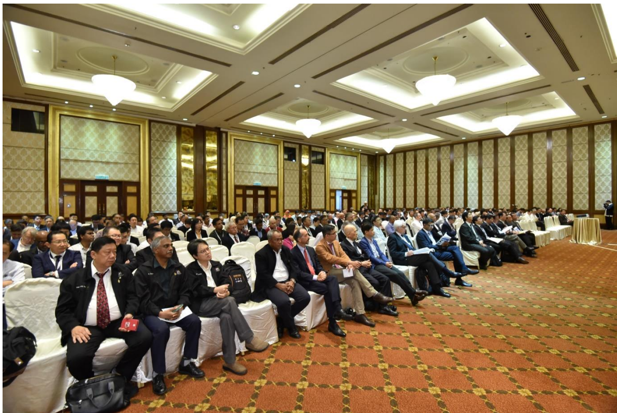
General View of SEAGC -2AGSSEAC Participants