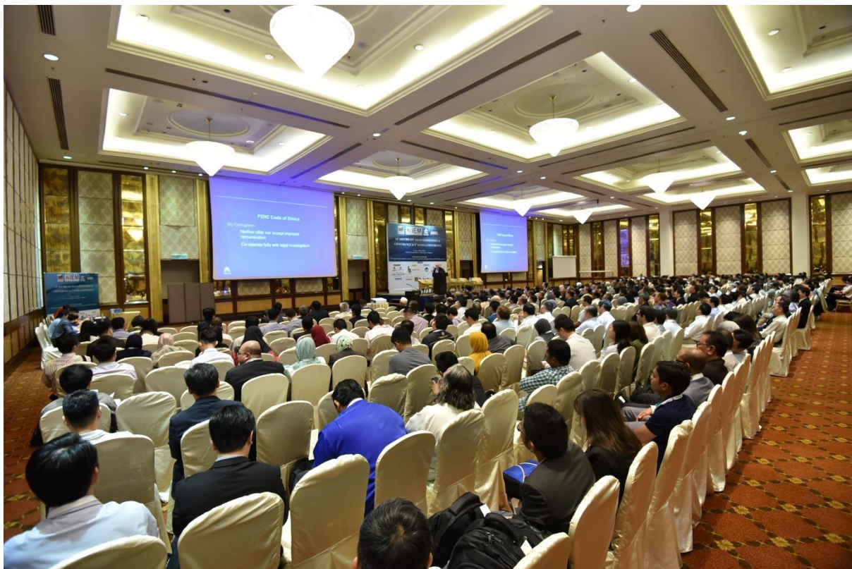
General View of SEAGC -2AGSSEAC in Progress