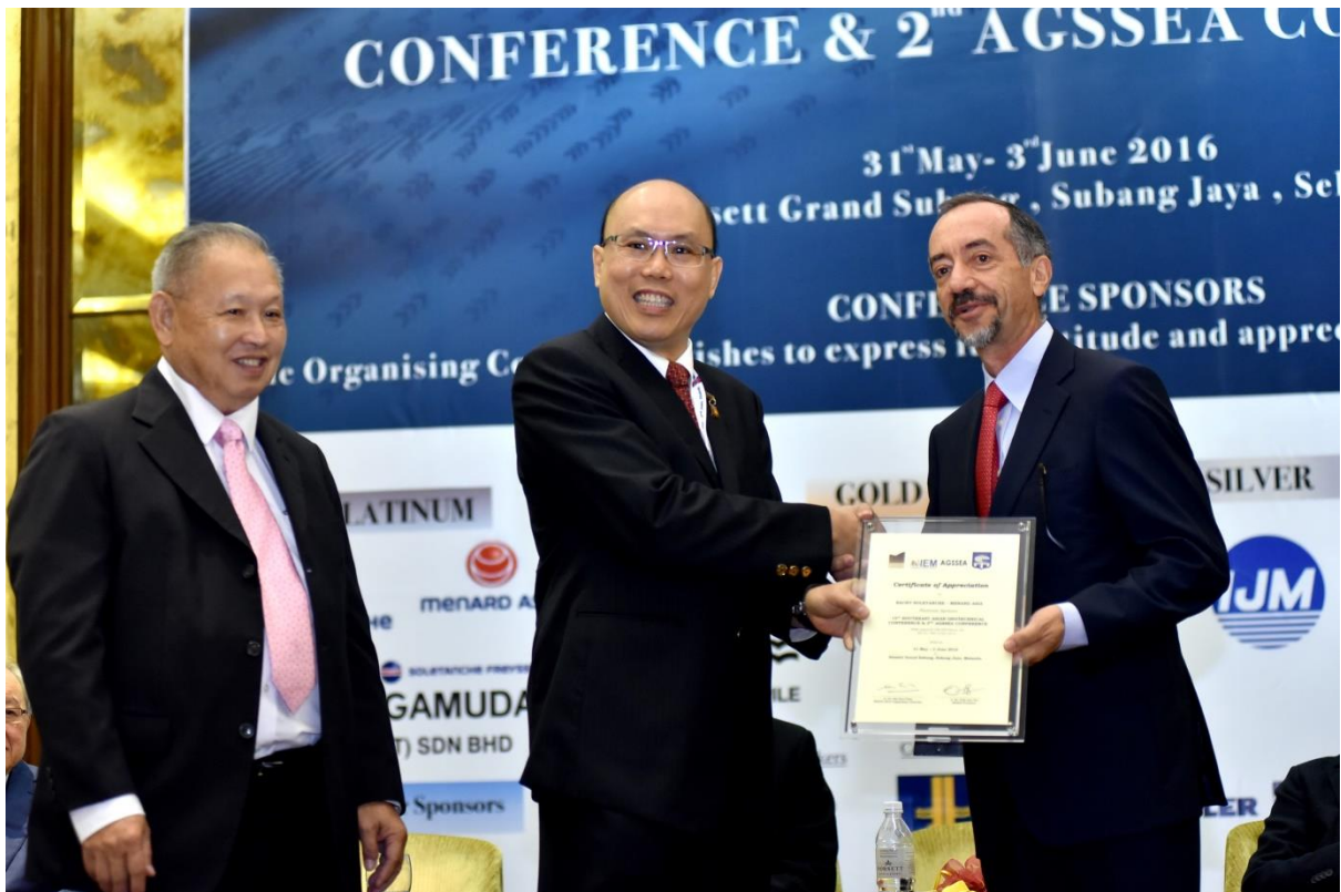
Presentation of Certificate of Appreciation to Sponsor at the Opening Ceremony