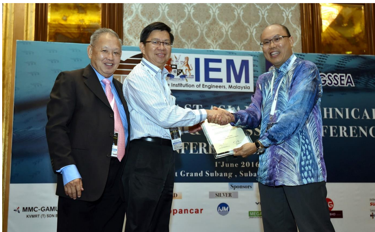
Presentation of Certificate of Appreciation to Sponsor at the Conference Banquet