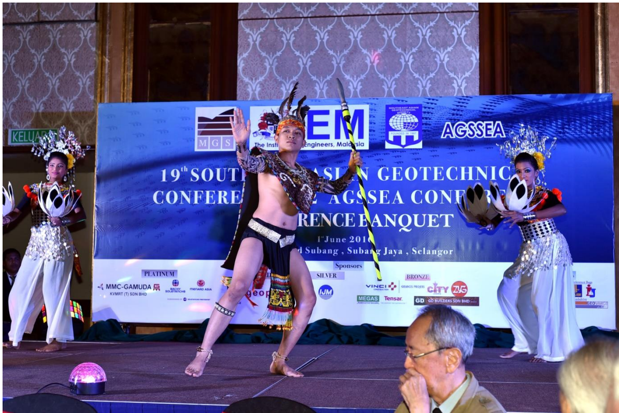
East Malaysian Dance