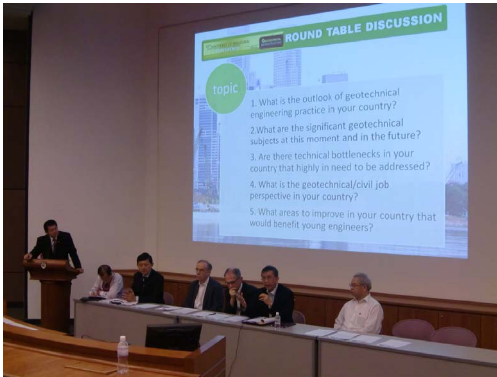
Roundtable Discussion between the reputable mentors and the young delegates