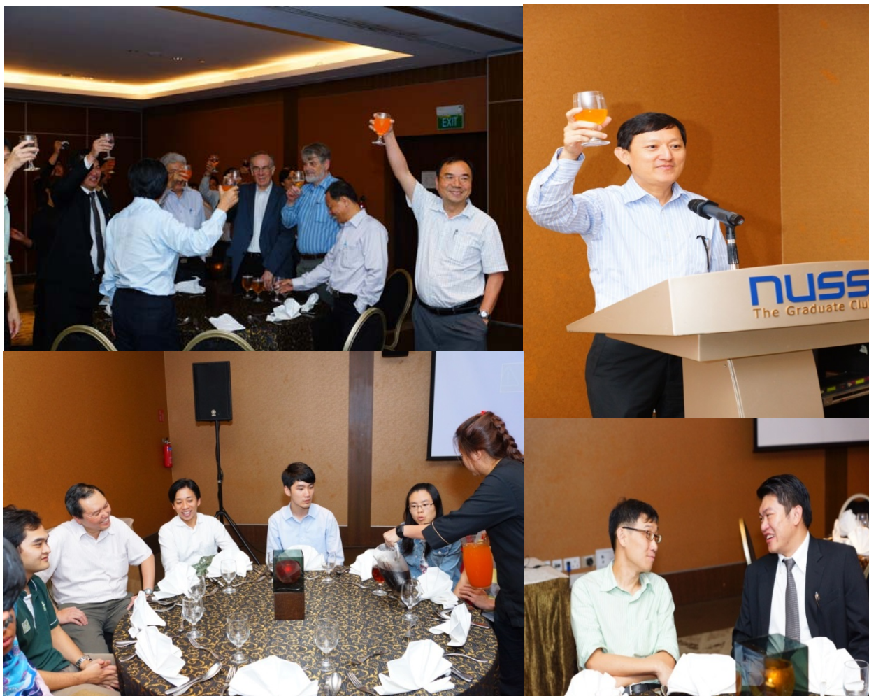
Dinner Reception and happy hour at NUSS Kent Ridge Guild House