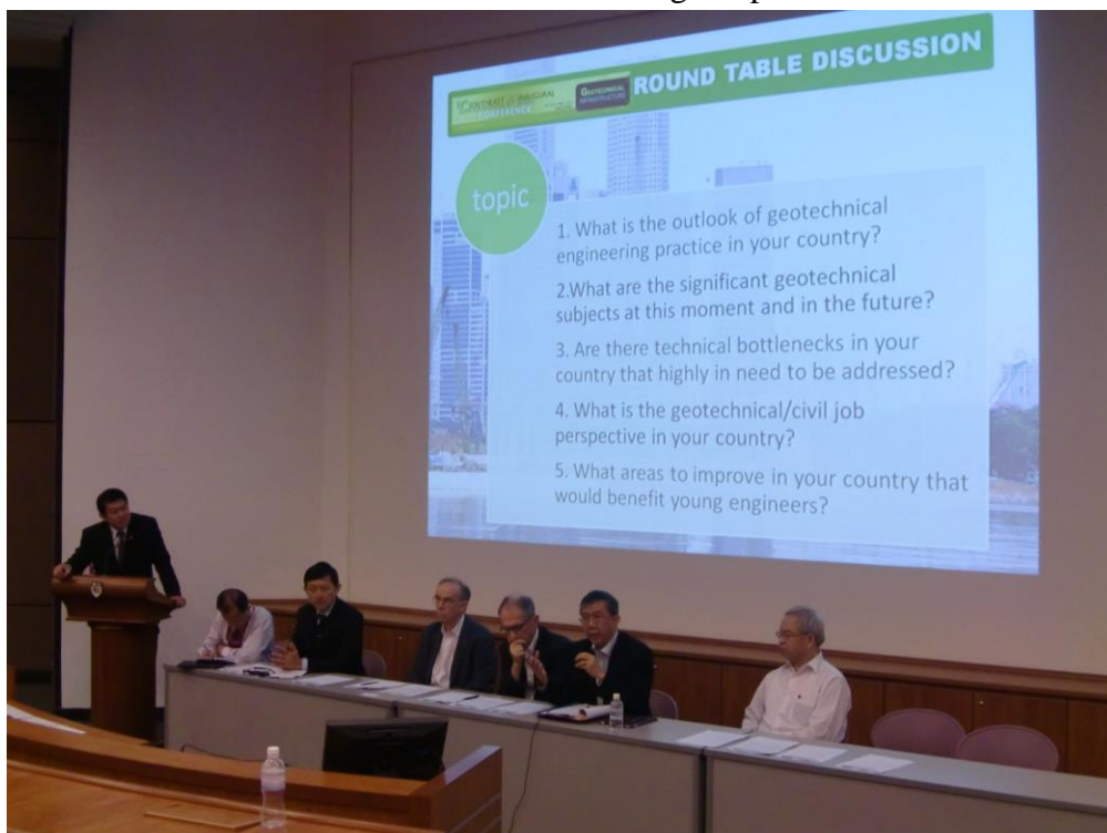
Roundtable Discussion between the reputable mentors and the young delegates