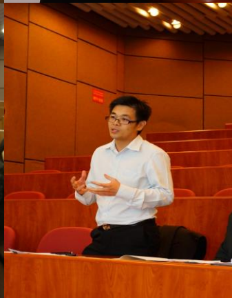
Our young and dynamics delegates