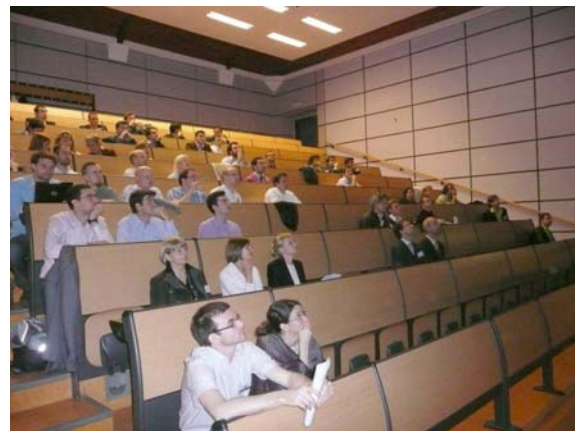
Figure 4. General view of the lecture hall