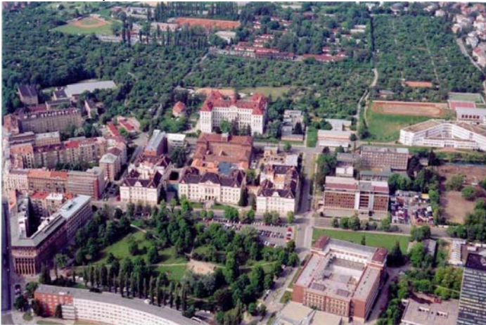
Figure 1. General view on the complex of buildings of the Faculty of Civil Engineering BUT, Brno