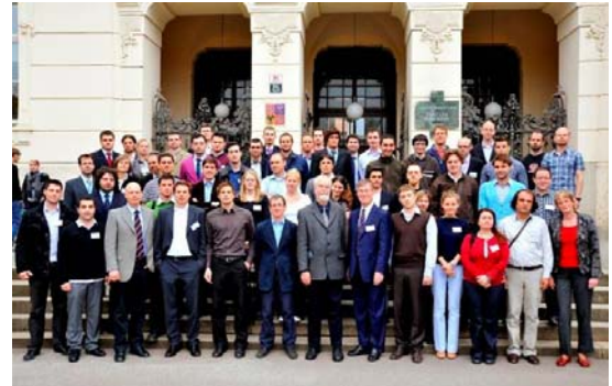
Figure 2. Group photo in front of building of the Faculty of Civil Engineering